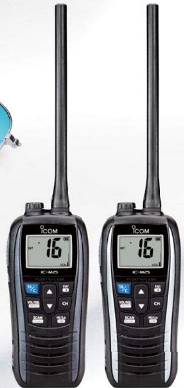
● Metallic Gray