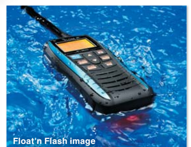
Float'n Flash image