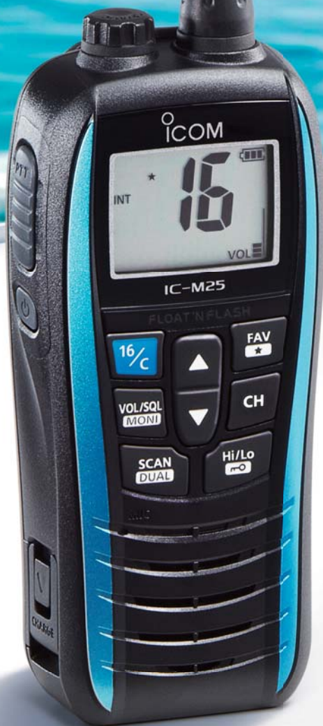
● Marine Blue