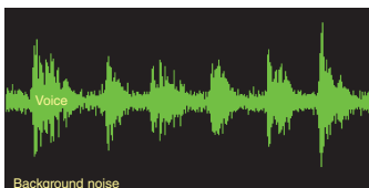
Noise Canceling OFF